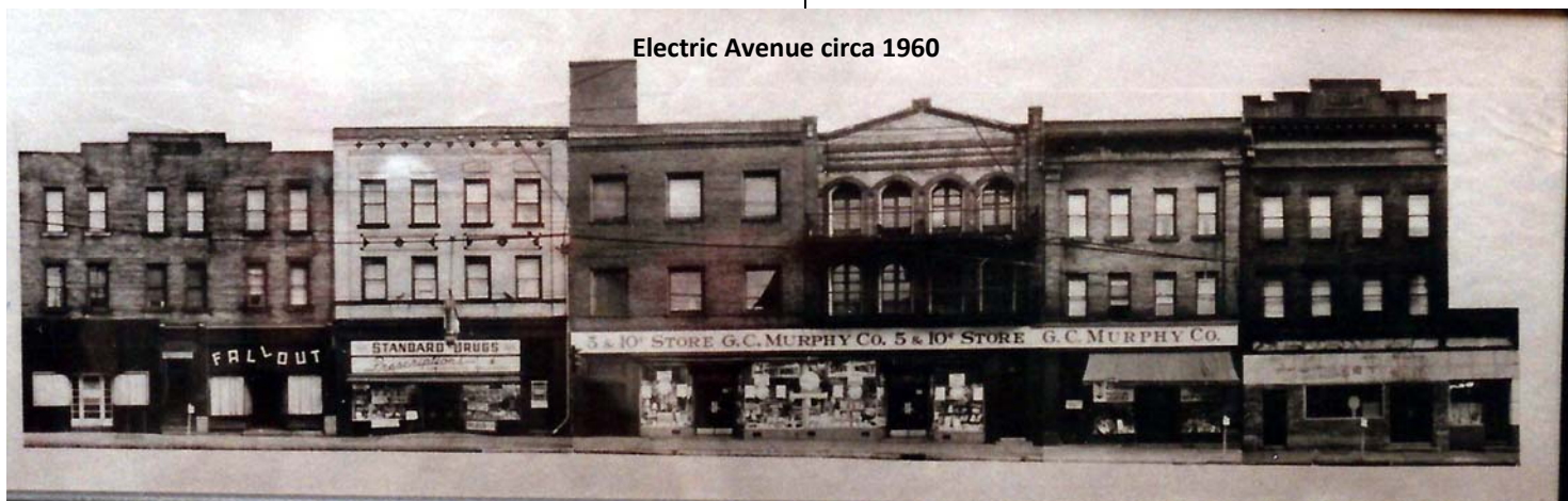
Electric Avenue circa 1960