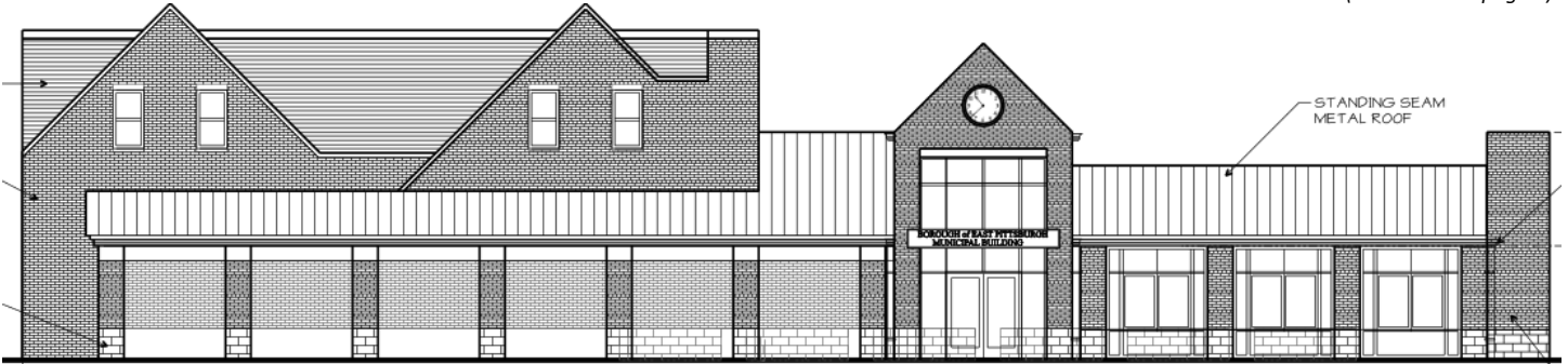
View from Bessemer Ave